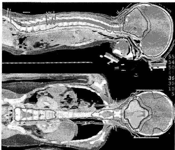
Figure 2 Sagittal and coronal composite dose displays for a child with high-risk medulloblastoma undergoing craniospinal irradiation with protons. Prescription dose to the craniospinal axis for this child with high-risk disease is 36 CGE and the dose to the posterior fossa is 54 CGE. Note the absence of significant exit dose beyond the anterior border of the vertebral bodies, thus sparing the bowel, heart, and mediastinum from potential side effects of radiotherapy.

brainstem. All children with local control maintained their performance status, except one, who developed Moyamoya disease. All six patients with optic pathway tumours and useful vision maintained or improved their visual status.